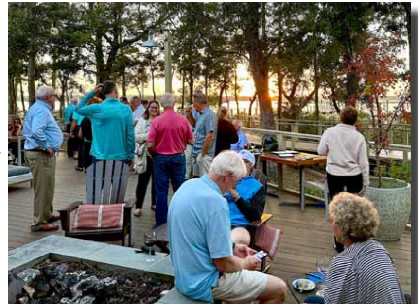
Balmy weather and a beautiful sunset made for a pleasant autumn evening.