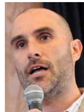
Oblinger: UNCW sports