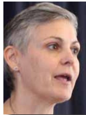
Connors: Public libraries

For more on our international and literacy projects, SEE: page 1 .