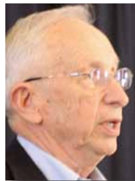
Hickman: Air cavalry